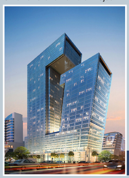
G Tower Grand Rama 9 Project

Picture of the G Tower Grand Rama 9 Project