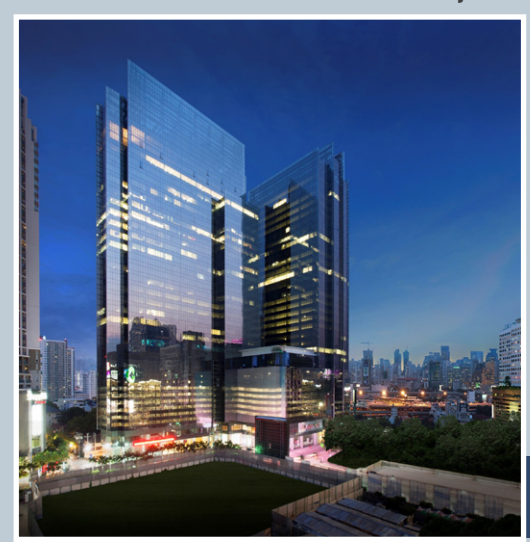
The Ninth Towers Grand Rama 9 Project

Picture of the Ninth Towers Grand Rama 9 Project