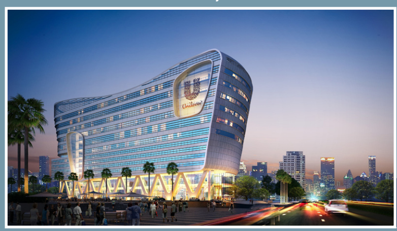
Unilever House Grand Rama 9 Project

Picture of Unilever House Grand Rama 9 Project